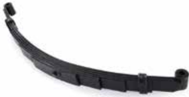
TANDEM LEAF SPRING 036309