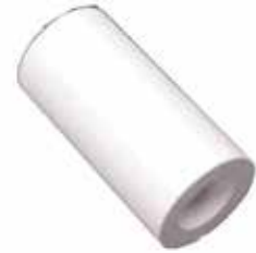
NYLON BUSH 036381