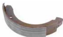
MECHANICAL BRAKE SHOES 036133