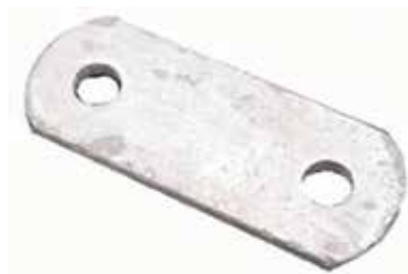
SHACKLE PLATE 036377