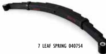
7 LEAF SPRING 040754

45X8X710 2 LEAF 700KG 036298 45X8X710 3 LEAF 850KG 036299 45X8X710 4 LEAF 1100KG 036300 45X8X710 5 LEAF 1300KG 036301 45X8X710 6 LEAF 1500KG 036302 45X8X840 7 LEAF 1600KG 040754 OUTBACK AL-KO 6 LEAF 60 X 7MM 035100