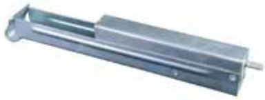
ADJUSTABLE FRONT LEG 006470