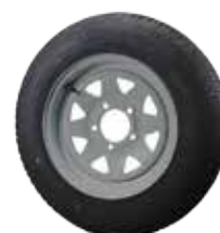
13" WHEEL HT/FORD 043160