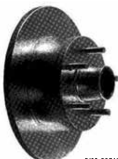
DISC BRAKE HUB 036166