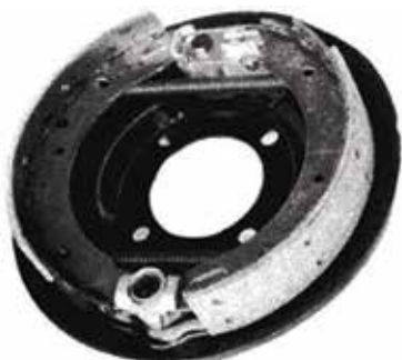
BRAKE ASSEMBLY 006340