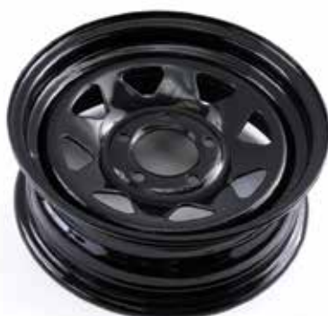
STEEL ROAD WHEEL 036453