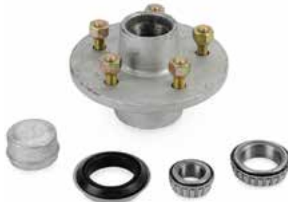
GALVANISED HUB KIT 040629