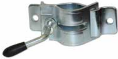
CLAMP ONLY FOR CAMEC JOCKEY WHEEL