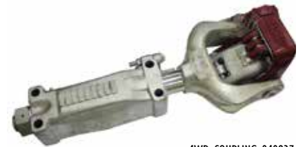
4WD COUPLING 040837