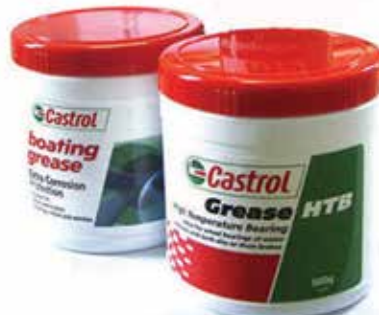
HIGH TEMP BEARING GREASE 006579