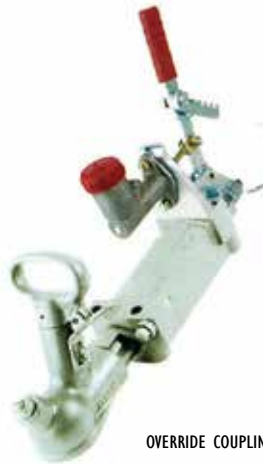
OVERRIDE COUPLING 006281