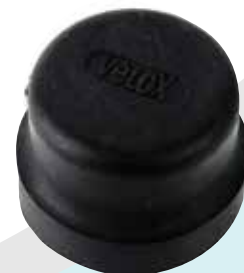
RUBBER DUST CAP 036478