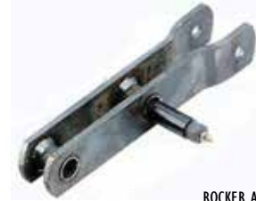
ROCKER ARM 036360