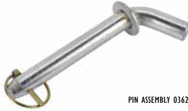
PIN ASSEMBLY 036216