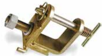
U BRACKET AND SPRING 006295