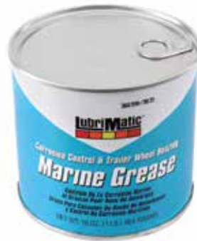
MARINE GREASE 006576