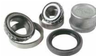
BEARING KIT 006565