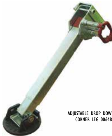
ADJUSTABLE DROP DOWN CORNER LEG 006483