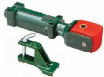
COUPLING 4WD 006302