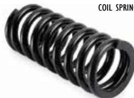
COIL SPRING 036827