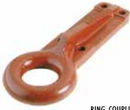
RING COUPLING 036202