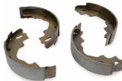
BRAKE SHOES 040625