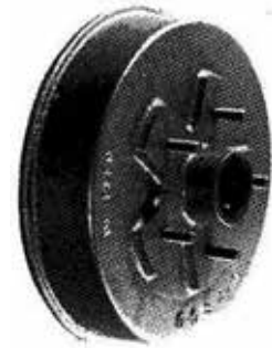
ELECTRICAL HUB DRUM KIT 036126