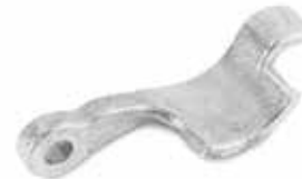
REVERSING CATCH 036221