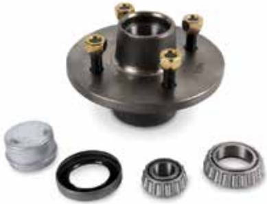
NON BRAKED HUB 036088