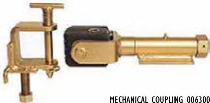
MECHANICAL COUPLING 006300