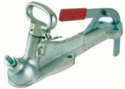
COUPLING ELECTRICAL AL-KO ZINC PLATED

Suits electric brakes. Quick release, 4 hole bolt on, 3500kg max load.