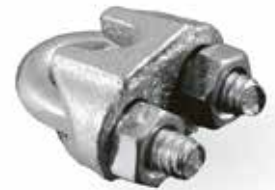
BRAKE CABLE THIMBLES