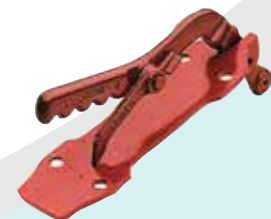
ANTI SWIVEL BASE PLATE 036220