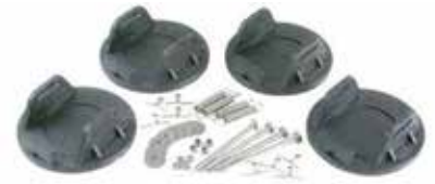
CORNER STEADY PADS 006486