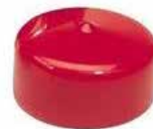
BEARING BUDDY COVER 006575