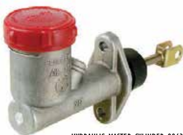
HYDRAULIC MASTER CYLINDER 006346