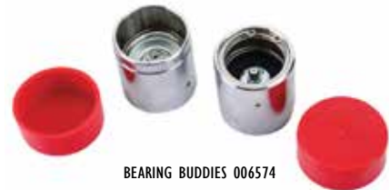
BEARING BUDDIES 006574