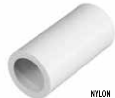
NYLON BUSH 006534