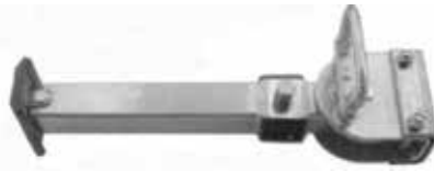
ADJUSTABLE DROP DOWN LEG 034280