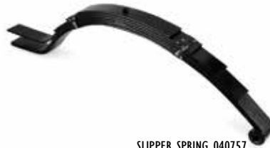
SLIPPER SPRING 040757