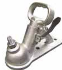
QUICK RELEASE COUPLING 036199