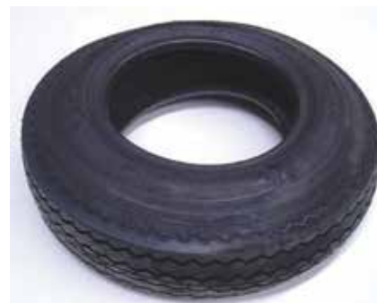
RUBBER TYRE 036480