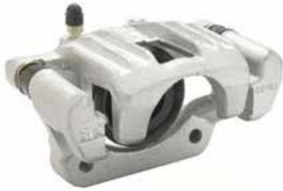
HYDRAULIC DISC BRAKE CALIPER 038762