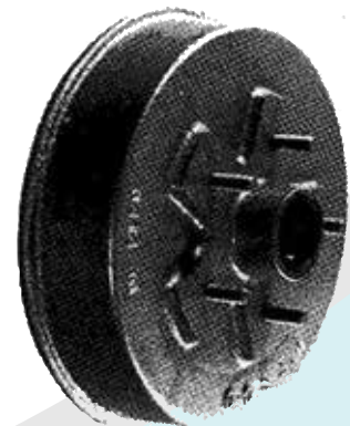
GALVANISED HUB KIT 036102