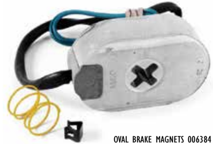
OVAL BRAKE MAGNETS 006384