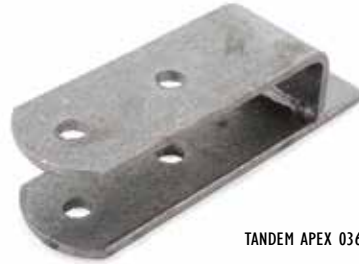
TANDEM APEX 036359