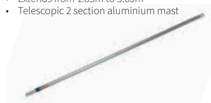
CAMLOCK TV MAST ALUMINIUM - 32MM 002356

Aluminium Camlock action. Lightweight and compact.