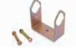
A-FRAME MOUNT FOR TV MAST 042664

Universal "A" frame clamp to fix antenna mast to caravan "A Frame".