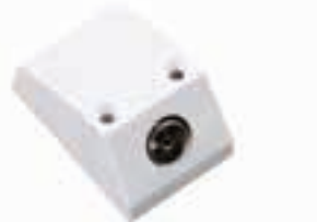
COAXIAL SURFACE SOCKET EXTERNAL 002390