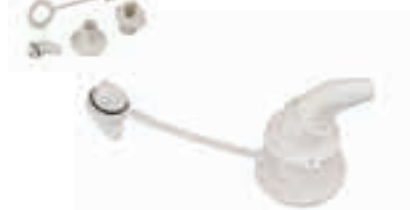
THRU THE WALL DIRECT CONNECT TO SUIT COAXIAL CABLE 034974

Connects antenna directly to the TV to avoid breaks in the connection.