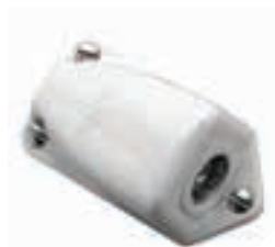
COAXIAL ANGLE SOCKET (30TV75S) 002389