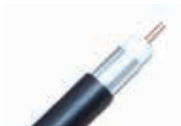
COAXIAL TV CABLE 75OHM 002336