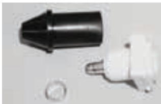
COAXIAL MECHANISM (30TV75M) 002392