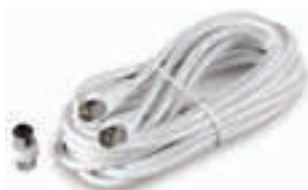
COAXIAL 4.5M LEAD (HOME STYLE LEAD) 035134