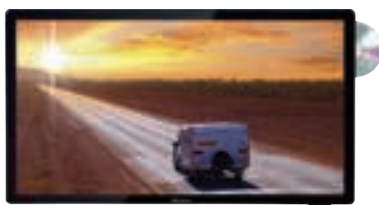
RV MEDIA EVOLUTION TV - 22" 044695