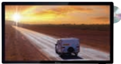
RV MEDIA EVOLUTION TV - 24" 044478

As most RV TV's are mounted on the wall and operate from the RV's 12V system, RV Media Evolution Series TV's are not supplied standard with a stand and 240V plugpack that in most cases are not used. This ensures that this Premium TV is produced using only A-Grade LCD panels and premium components that have been specifically sourced and developed for the Australasian RV environment. Should you require a desk-top stand or 240V plugpack, please order one of the appropriate TV Accessory Kits listed below.