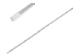
CAMLOCK TV/POOL POLE ALUMINIUM - 25MM 002357

Aluminium Camlock action. Lightweight and compact.