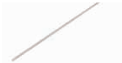
CAMLOCK TV/POOL POLE ALUMINIUM - 32MM 002363

Connects antenna directly to the TV to avoid breaks in the connection.