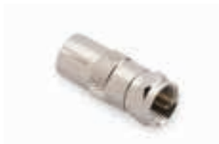
COAXIAL ADAPTER (FOR USA ANTENNA) 002387

To suit USA Wall Plate - female connector to standard TV lead.