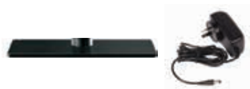
19" EVOLUTION ACCESSORY PACK 044571

Includes a 240V plugpack power supply and desktop stand to suit Evolution 19" TV's only.