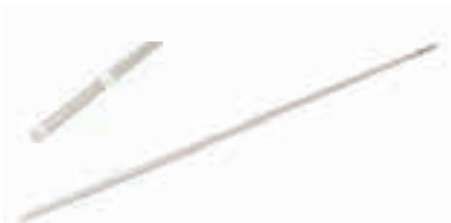
CAMLOCK TELESCOPIC MAST ALUMINIUM - 25MM 035132

Aluminium Camlock action. Lightweight and compact.