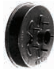
HUB DRUM KIT 036128