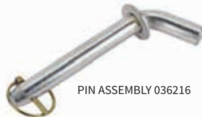
PIN ASSEMBLY 036216