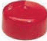
BEARING BUDDY COVER 006575