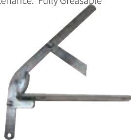
MECH BRAKE ARM ATTACHMENT AL-KO 044568

This ALKO Lever Hand Brake and Mounting Plate suits the ALKO Mechanical Override Coupling System.