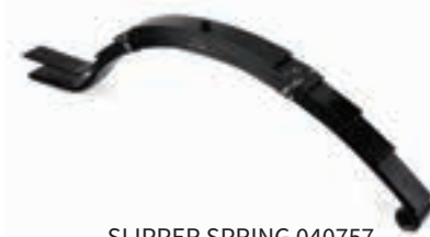
SLIPPER SPRING 040757

006654 - WINDSOR SHOCK ABSORBER 4081-001 006655 - SHOCK ABSORBER PLATE SUIT WINDSOR 036423 - SHOCK ABSORBER KIT - AL-KO 036827 - COIL SPRING SUIT WINDSOR SHOCK ABSORBER