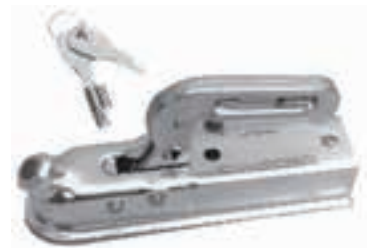
COUPLING FIXED PRESSED METAL AL-KO AK7 006276