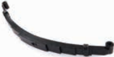
TANDEM LEAF SPRING 036309