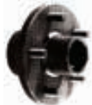
HQ HOLDEN 038751