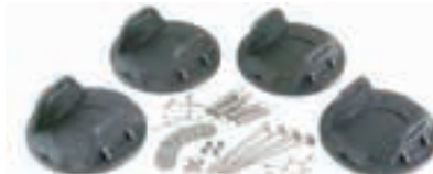
CORNER STEADY PADS 006486