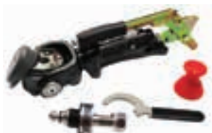
DO35 COUPLING V3-I WITH INTEGRATED HANDBRAKE 044635

Forged steel, high quality polyurethane, laser cut stainless steel and precision casting has been brought together to increase the couplings strength yet also reduce weight. This updated DO35 is over 50% stronger than the outgoing model. These advanced processes have also allowed the elimination of hitch adaptors allowing you to get on the road with less fuss.