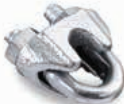
BRAKE CABLE CLAMPS