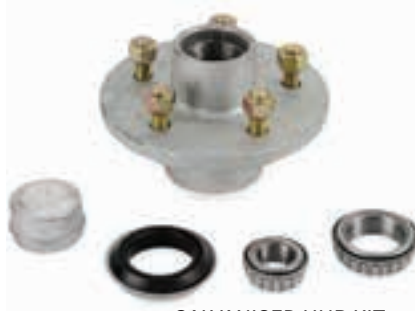
GALVANISED HUB KIT 040629

Complete with studs, nuts, bearings and seals. All unbraked hub kits are manufactured from high grade ductile iron to give maximum achievable strength. For marine conditions, there are a range of hubs that are galvanised for additional strength. Most jus available with Ford (Slimline) bearing option