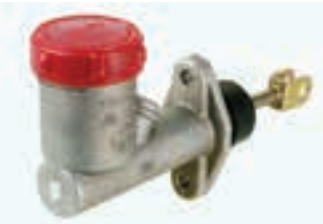
HYDRAULIC MASTER CYLINDER 006346