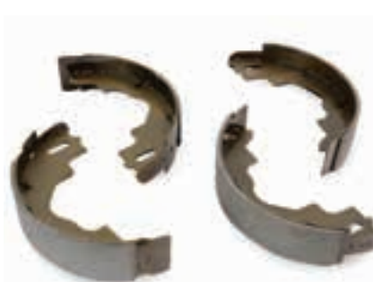
BRAKE SHOES 040625