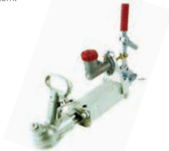
OVERRIDE COUPLING 006281 OVERRIDE COUPLINGS

This ALKO Lever Hand Brake and Mounting Plate suits the ALKO Mechanical Override Coupling System.