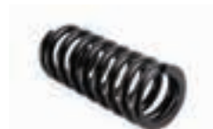
SPRING TO SUIT WINDSOR 036827