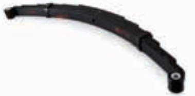
7 LEAF SPRING 040754