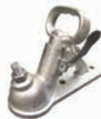
QUICK RELEASE COUPLING 036199