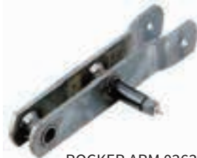
ROCKER ARM 036360

036328 - 45 X 6 610 7 LEAF 1350KG 040758 - 44 X 6 X 720 5 LEAF 900KG 040757 - 44 X 6 X 720 6 LEAF 1050KG 036333 - DACROMET 3 LEAF 600KG 036334 - DACROMET 4 LEAF 750KG 036335 - DACROMET 5 LEAF 1000KG 036336 - DACROMET 6 LEAF 1200KG 036337 - DACROMET 7 LEAF 1350KG