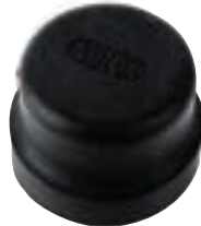
RUBBER DUST CAP 036478