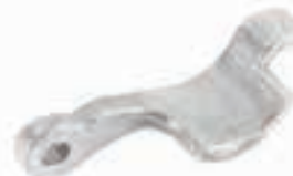
REVERSING CATCH 036221