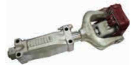
4WD COUPLING 040837

Suits electric brakes. Quick release, 4 hole bolt on, 3500kg max load. 50mm Ball