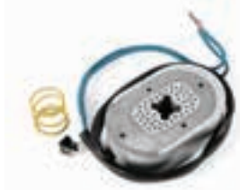
10" OVAL, SUITS HAYES AND AL-KO 006384