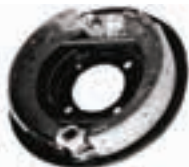
BRAKE ASSEMBLY 006340