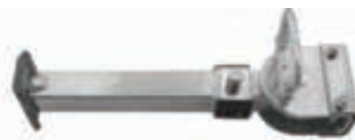
ADJUSTABLE DROP DOWN LEG 034280