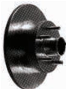
DISC BREAK HUB 036166

006336 - ADAPTOR PLATE MOUNT NUT ONLY 7/16" UNF