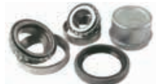
BEARING KIT 006565

036147 - MECHANICAL DISC BRAKE ADAPTOR PLATE 40MM AL-KO VERSION