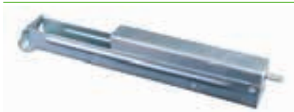
ADJUSTABLE FRONT LEG 006470