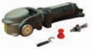
DO35 COUPLING V3-R 044634

The V3-R version of the DO35 is without a handbrake and ideal for caravans with a pre-existing handbrake mounted elsewhere on the A-frame.