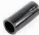
NYLON BUSH 006535

036360 - TANDEM FABRICATED ROCKER ARM WITH BUSHES, SUITS 45MM SPRING 041499 - TANDEM ROCKER SPRING ROCKERS SUIT 60MM SHACKLE SPRING, 18MM PIN, 202MM CENTRE 036364 - FRONT U HANGER WITH 12MM HOLE 45MM WIDE 036365 - FRONT U HANGER WITH 14MM HOLE 45MM WIDE 038133 - CENTRE ROCKER PIN AL-KO M18 036367 - REAR HANGER BLOCK NO BUSH, 22MM I.D. 036368 - REAR U HANGER SUIT SLIPPER SPRING 036375 - SHACKLE BOLT 3AND1/2" X1/2" WHIT 036369 - SHACKLE BOLT AND NUT 3 1/2"X9/16" GREASEABLE 036370 - SHACKLE BOLT AND NUT 3 1/2"X5/8" GREASEABLE 036371 - SHACKLE BOLT AND NUT 3 1/2"X9/16" NON-GREASE 036372 - SHACKLE BOLT AND NUT 3 1/2"X5/8" NON-GREASE 036387 - AXLE PAD SUIT FLAT AXLE 036380 - FISH PLATE GALVANISED, MULTI FIT 8MM 006527 - FISH PLATE MULTI FIT 8MM BLACK 036376 - GREASE NIPPLE STRAIGHT 036374 - NUT NYLOC UNF 5/8" 006530 - NUT NYLOC UNF 1/2" 038809 - NUT NYLOC M16 AL-KO 038135 - NUT NYLOC M18 AL-KO 006531 - NUT ZINC PLATE 1/2"