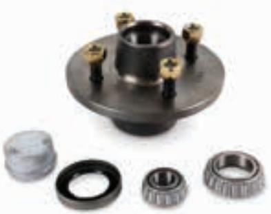
NON BRAKED HUB 036088