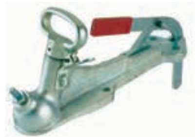
COUPLING ELECTRICAL AL-KO ZINC PLATED 006280

Suits electric brakes. Quick release, 4 hole bolt on, 3500kg max load. 50mm Ball