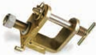
U BRACKET AND SPRING 006295