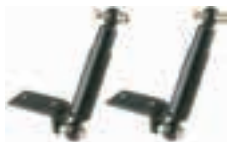
AL-KO SHOCK ABSORBER KIT 036423