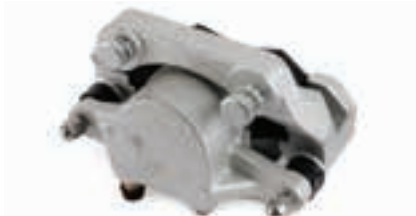
HYDRAULIC DISC BRAKE CALIPER 034170