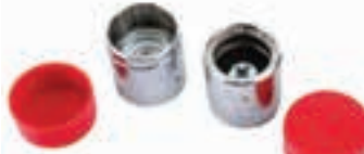
BEARING BUDDIES 006574