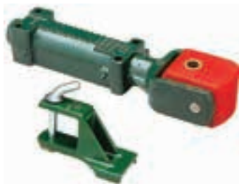
TRIGG COUPLING 4WD 006302