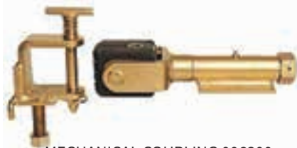
MECHANICAL COUPLING 006300