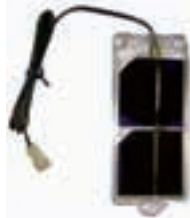
SOLAR FRIDGE FAN - SOLAR PANEL 000685

This solar panel suits the Solar fridge fan (refer code 000684).