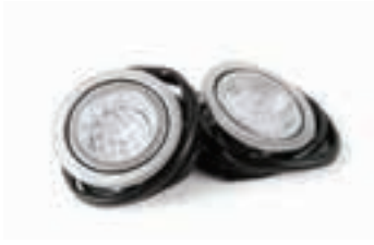
REPLACEMENT LED DOWN LIGHT LONG LEAD TO SUIT CAMEC 12V RANGEHOOD (REFER CODE 040864)