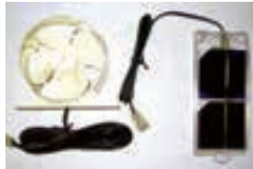
SOLAR FRIDGE FAN 000684

This solar panel suits the Solar fridge fan (refer code 000684).