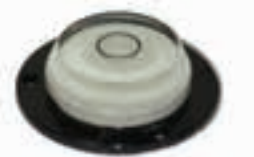
CAMEC FRIDGE BULLS EYE LEVEL 042670

Increases cooling efficiency by up to 40% on hot days. Attaches to bottom of refrigerator compartment and blows into the coils and toward the top vent.