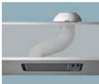
ELECTROLUX FLUSH MOUNT RANGEHOOD 12V CK150

Note: This switch will illuminate for the 12V rangehoods.