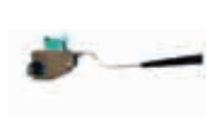
SPIN SENSOR - PART ID 6 - 041907