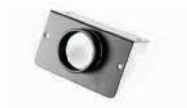
OUTLET ADAPTOR TO SUIT CAMEC 12V RANGEHOOD - REFER CODE 040864