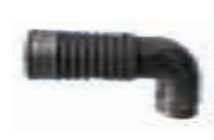
PUMP HOSE HQ RUBBER - PART ID 93 042797