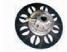
MOTOR PULLEY - PART ID 66 - 041919