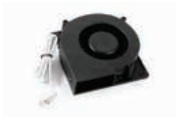
REPLACEMENT FAN TO SUIT CAMEC 12V RANGEHOOD (REFER CODE 040864)