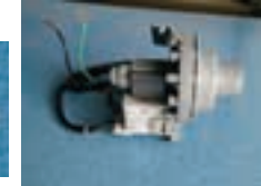
DRAIN PUMP - PART ID 91 - 041913