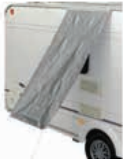
CARAVAN FRIDGE VENT SCREEN 050021

improves the efficiency of your fridge on a hot day. 199gsm, 95% shadecloth.