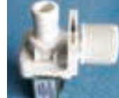
WATER INLET VALVE - PART ID 16 - 041912