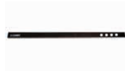
REPLACEMENT FRONT STICKER TO SUIT CAMEC 12V RANGEHOOD (REFER TO CODE 040684)

Outlet Adaptor for Camed 12V Rangehood (refer code 040864).