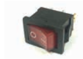
SWITCH FOR CAMEC RANGEHOOD