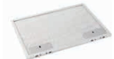
REPLACEMENT FILTER TO SUIT CAMEC 12V RANGEHOOD (REFER CODE 040864)