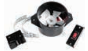
FRIDGEMATE 12V FRIDGE FAN 000688

Solar powered exhaust fan increases the cooling efficiency of refrigerator by venting hot air from the coils.