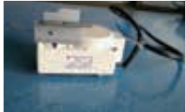
MODE SWITCH - PART ID 55 T - 041911