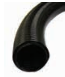
CAMEC RANGEHOOD DUCT TUBE BLACK