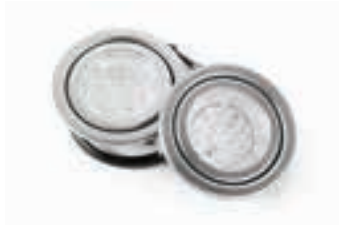
REPLACEMENT LED DOWN LIGHT SHORT LEAD (PCB SIDE) TO SUIT CAMEC 12V RANGEHOOD (REFER CODE 040864)