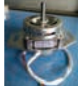
MOTOR - PART ID 68 041909