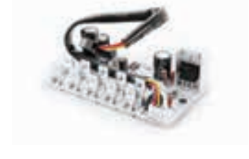
REPLACEMENT CIRCUIT BOARD TO SUIT CAMEC 12V RANGEHOOD (REFER CODE 040865 & 040864)