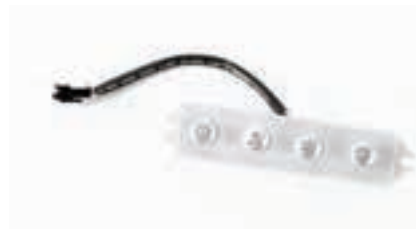
REPLACEMENT SWITCH PANEL TO SUIT CAMEC 12V RANGEHOOD (REFER CODE 040864)