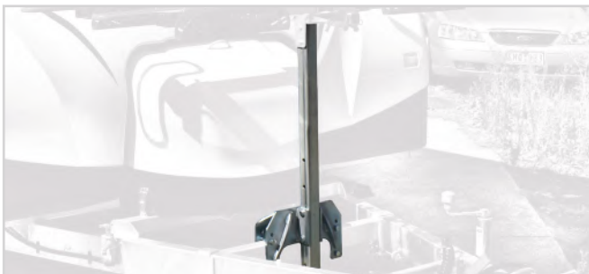
Optional Bolt-On Mount